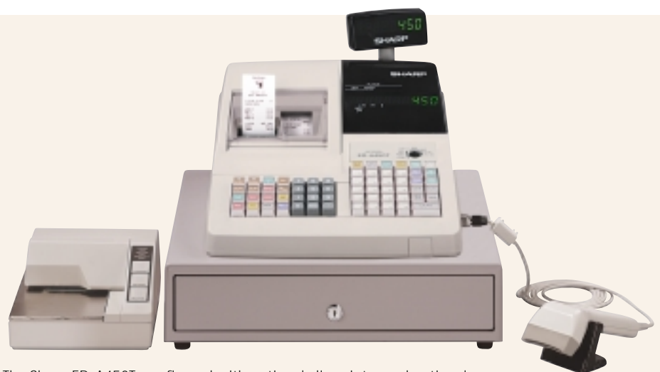
The Sharp ER-A450T, configured with optional slip printer and optional scanner, delivers superior functionality to your business.